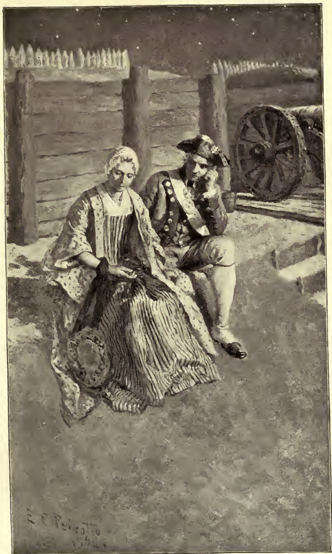
Belinda and the Ensign on the moonlit rampart.